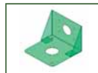
Side Mounting Bracket